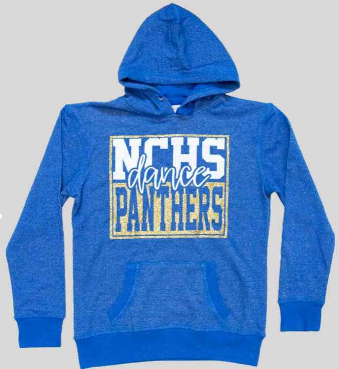
J. America: Item #8236 CAD-CUT® Glitter Flake™ Rainbow White & Gold

Glitter knit fabrics are a favorite for spirit wear. Pairing garments like this with CAD-CUT® Glitter Flake™ makes for the ultimate glitter finish and a best seller with cheer and dance teams.