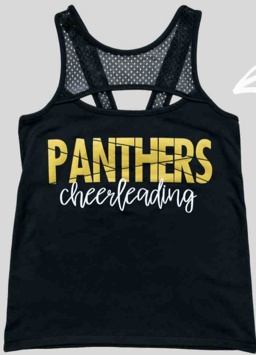
Boxercraft: Item #S86B CAD-CUT® Premium Plus™ Metallic Gold CAD-CUT® Glitter Flake™ Rainbow White