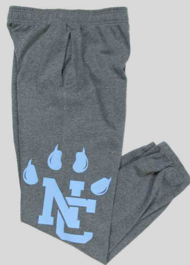
Boxercraft®: Item #DM465 CAD-CUT® Fashion Film® Columbia

Big and bold graphics like this pant leg "wrap-around" print on the side of the sweatpants are a popular trend in large sportswear retailers.