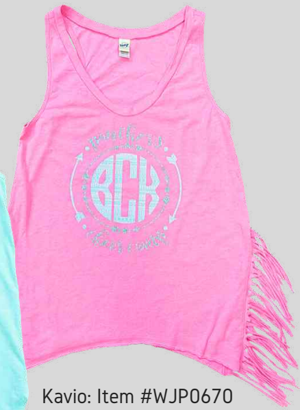
Kavio: Item #WJP0670 CAD-CUT® Glitter Flake™ Mint & CAD-CUT® Patterns Bohemian