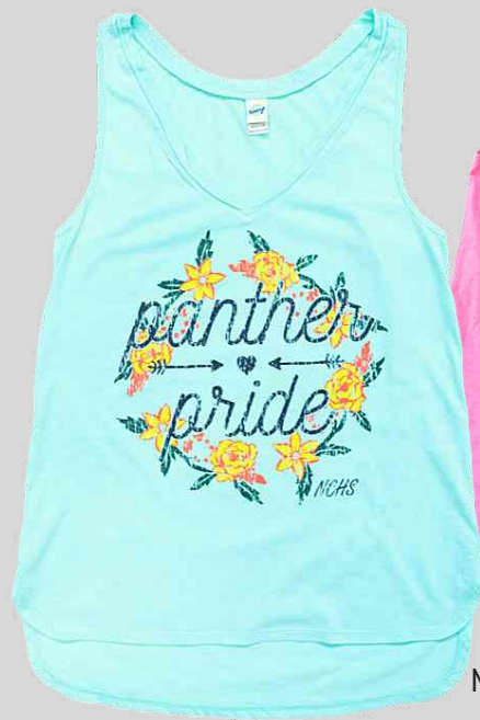
Kavio: Item #GJP0666 Goof Proof® Screen Printed Transfer

Distressed, weathered looks can be achieved in seconds using screen printed transfers from Transfer Express.