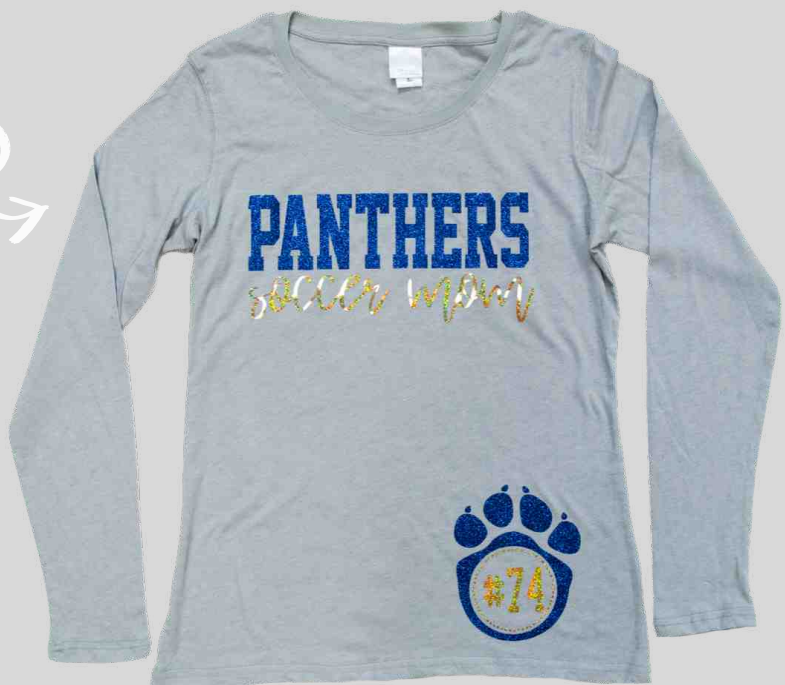
J. America: Item #8860 CAD-CUT® Glitter Flake™ Navy CAD-CUT® Hologram Gold

Pairing CAD-CUT® Glitter Flake™ on glitter knit fabrics is the perfect way for your fans to stand out in the crowd. For an ultimate bling finish pair CAD-CUT® Glitter Flake™ & Hologram.